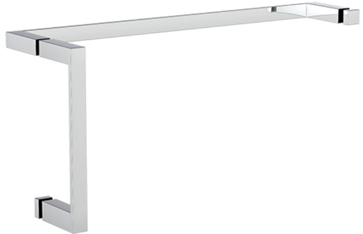
Offset Door Handle Shown with no Rosette